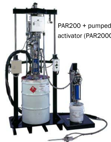
PAR200 + pumped activator (PAR200C)